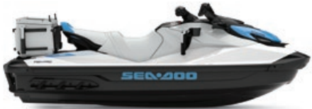
White and Gulfstream Blue