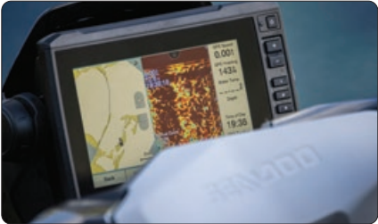
Garmin 7" GPS & Fish Finder A top-of-the-line navigation, charting and fish-finding system using an in-hull transducer and mid-CHIRP sonar. Includes token for access to free upgraded regional maps.