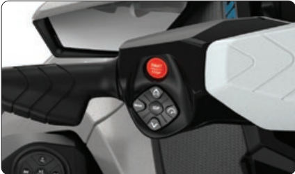
iDF - Intelligent Debris Free System An innovative, industry-first system that allows you to free your pump of weeds and debris with intuitive handlebar-activated controls.