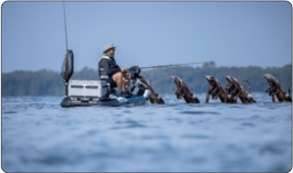
Angled Gunwale Footrests Ensures ergonomic and secure posture while fishing from a side position.