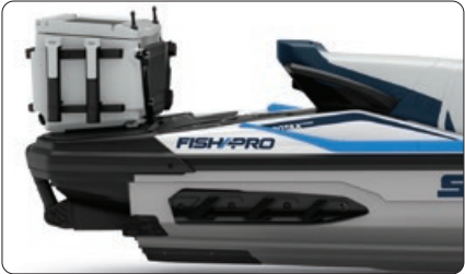
Rear Deck Extension with LinQ attachment system Adds 11.5 inches to the back of the watercraft to increase stability, space, and storage capability.