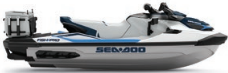
White and Gulfstream Blue