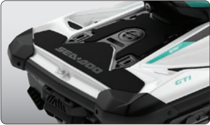
Swim Platform with Integrated LinQ System Exclusive quick-attach system on the largest swim platform in its category that allows for easy installation of accessories.