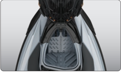
Large Front Storage An impressive 38 gallons of sealed storage space allows riders to safely stow belongings while riding.