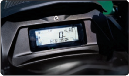
ECO Mode This exclusive to Sea-Doo models feature optimizes power output for up to 46% improved fuel efficiency.