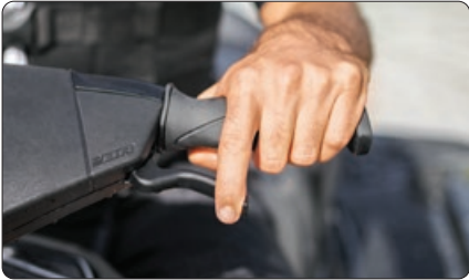
iBR - Intelligent Brake & Reverse Exclusive to Sea-Doo®, iBR stops the watercraft sooner and provides more control and maneuverability at low speeds and in reverse.