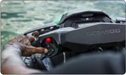
iDF - Intelligent Debris Free System An innovative, industry-first system that allows you to free your pump of weeds and debris with intuitive handlebar-activated controls.