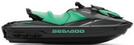
NEW Eclipse Black and Laguna Green