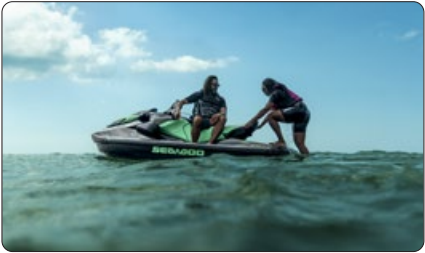
Boarding Ladder Makes boarding from the water easier and quicker.