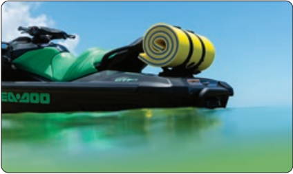
Swim Platform with Integrated LinQ System Exclusive quick-attach system on the largest swim platform in its category that allows for easy installation of accessories. 1