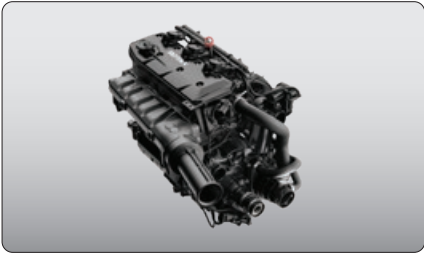
Rotax 1630 ACE - 130 / 170 Enjoy plenty of pep and great fuel economy with the 1630 ACE - 130 or opt for the 170 hp version, the most powerful naturally aspirated engine in the Sea-Doo® lineup.