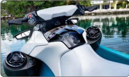
BRP Audio - Premium System (optional) A factory-installed, truly waterproof Bluetooth* audio system for an extra dose of fun and entertainment on the water.