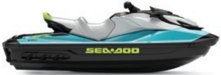
Teal Blue and Manta Green