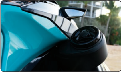
BRP Audio - Premium System (optional) A factory-installed, truly waterproof Bluetooth® audio system for an extra dose of fun and entertainment on the water.