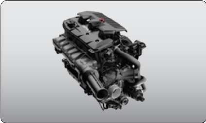
Rotax 1630 ACE - 230 Engine This powerful engine comes standard with a supercharger and external intercooler. It is optimized to run on regular fuel, which lowers fuel costs.