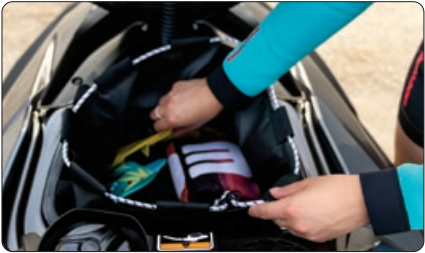
Large Front Storage An impressive 38 gallons of sealed storage space allows riders to safely stow belongings while riding. 1