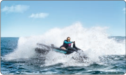
VTS (Variable Trim System) Provides handlebar-activated settings so riders can easily find the ideal trim for varying conditions.