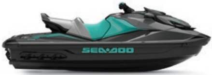
Eclipse Black and Reef Blue