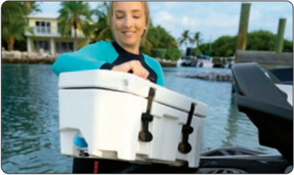
Swim Platform with Integrated LinQ System Exclusive quick-attach system on the largest swim platform in its category that allows for easy installation of accessories.