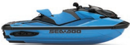
NEW Gulfstream Blue Premium