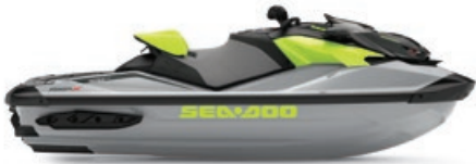
Ice Metal and Manta Green