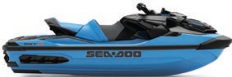
NEW Gulfstream Blue Premium