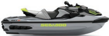
Ice Metal and Manta Green